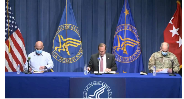
Operation Warp Speed Briefing December 9 th , 2020

Vaccination kits (syringes, alcohol swabs, dilutant, other supplies) to be sent to states for the Pfizer vaccine this Friday Allocated to all 50 states in equitable fashion Each state has vaccination plan ( https://web.csg.org/state-vaccine-plans/ ) 500k kept in reserve 2.9MM Doses delivered initially for first dose 2.9MM Doses delivered later for second dose